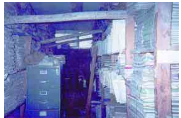
Court records “over the last 100 years” at the Supreme Court

Additionally, it provides that “the Interim Administration shall establish, with the assistance of the United Nations, a Judicial Commission to rebuild the domestic justice system in accordance with Islamic principles, international standards, the rule