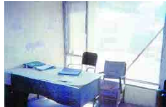
Holding area for prisoners at Kabul police substation

Substantive law being applied. The public prose-