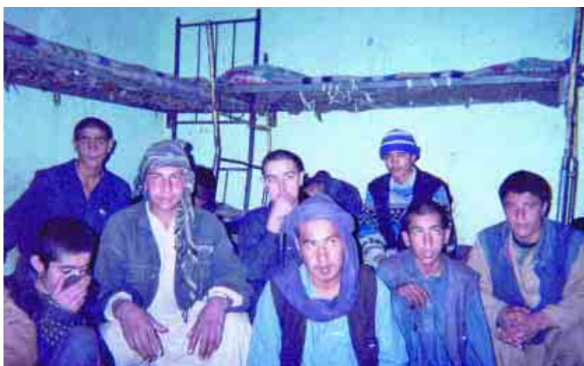
Adolescent males incarcerated at Kabul Jail

Juvenile detention. The Ministry of Justice is responsible for the detention of juveniles, ages 8-18 years. Previously, 35 children had been held in a facility in Kabul. However,