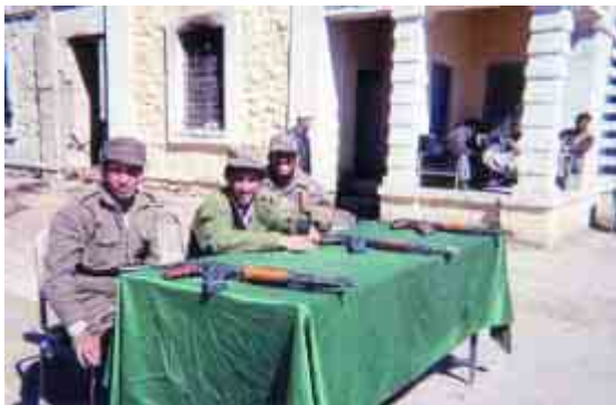
A checkpoint at Kabul jail

The Taliban declared invalid all non-Islamic laws enacted during the Communist regime, and reintroduced Shari'a in their place. Mullahs replaced professional judges, laws were strict, and punishments were swift and exceedingly harsh.