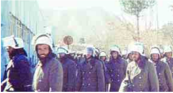
Police with donated riot-control helmets

patrols with police. The daily caseload for a substation varies; some days there are as many as ten arrests. Equipment on hand is generally limited to AK-47