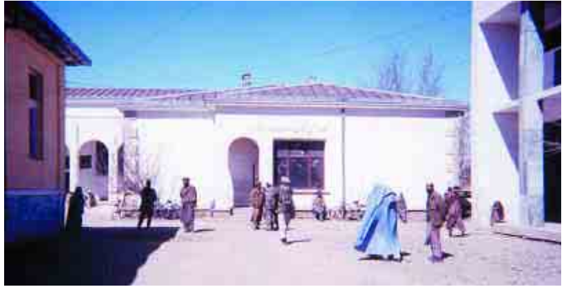
Kabul provincial courts

UNESCO support for disabled. UNESCO representatives indicated that the philosophical bases for