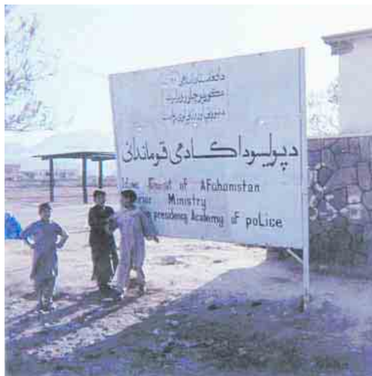
Entrance to Police Academy