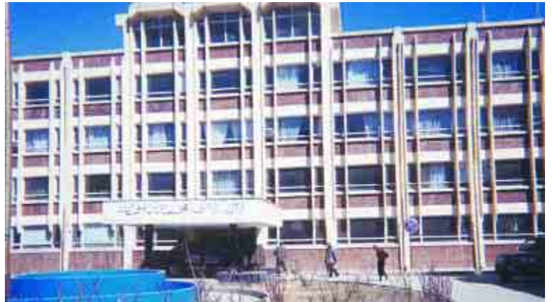
Ministry of Interior Headquarters

Structure and staff. CRAFT was unable to obtain clear information on the number of law enforcement personnel employed by the ministry. International community observers estimate that there are approximately 6,000-7,000 officers and regular policemen under the ministry's command. The ministry itself claims that it employs a total of 73,112 law enforcement personnel, operating in all 32 provinces of Afghanistan. All personnel fall within one of a number of categories, including officers, junior officers, patrolmen, civilian employees, and contractors. Officers appear to comprise approximately half the total personnel employed.