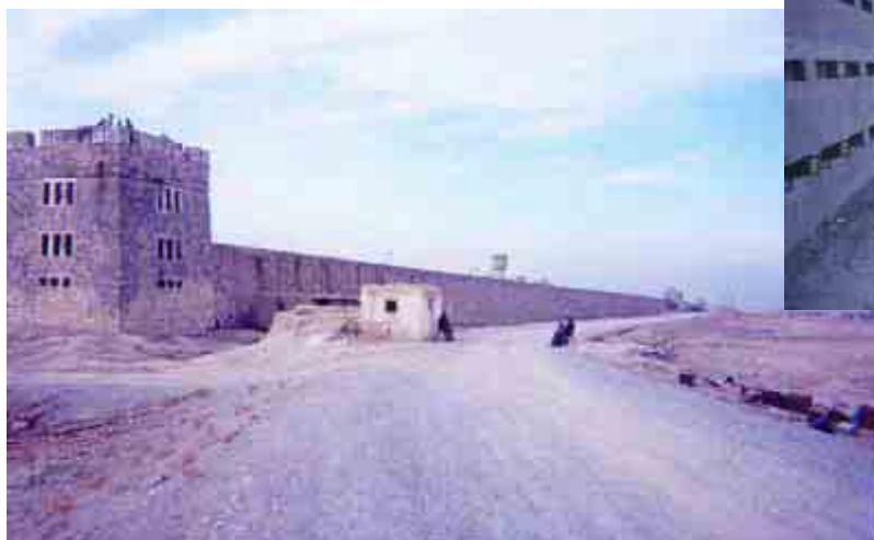
Outside Pulecharkhi Prison

In all cases, to have a real impact, assistance programs must be integrated—that is, they must address all elements of the system. In the criminal justice sys-