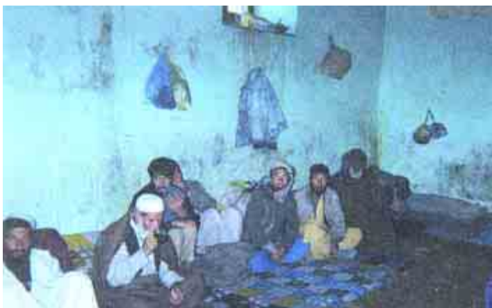
A cell at Kabul jail