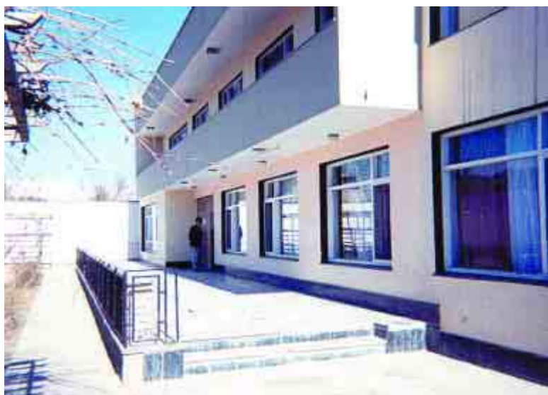
Emergency Loya Jirga Commission Headquarters

The first meeting was convened to discuss the major security questions facing the country. The second conference, a