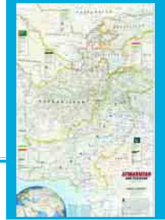
National Geographic Society, 2001

As a result of 23 years of war and civil conflict, and despite the recent removal of the Taliban and establishment of an Interim Authority, Afghanistan remains a country in chaos. Unless and until Afghanistan is at least modestly stable and secure, it will continue to represent a risk to the region and the world. The global order is still grappling with the question of failed states, but one lesson is certain: when governments fail, warlords, drug barons, or terrorists fill the vacuum. The only sure way to eliminate terrorism and extremism in Afghanistan is to support its leaders and people in their quest for internal stability and security, according to their own rich traditions and history.