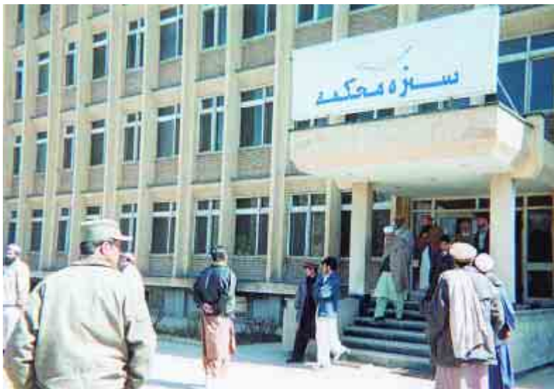
The Supreme Court

Judicial appointments process. Chairman Karzai currently is the final arbiter on judicial appointments. This apparently is consistent with the system employed in the past. Under that system, members of the Supreme Court made recommendations for judicial appointments, and forwarded them to the Chief Justice for signature. The Chief