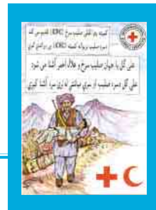
Information booklet from the ICRC on the laws of war