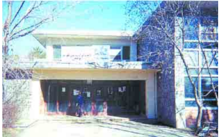
Entrance to Kabul Law Faculty

Entry requirements. There is no bar examination in Afghanistan. The only requirement to practice law is graduation from the Law or Shari’a Faculty. Reportedly, no entry exam is needed, as new recruits are “weeded out” during their first years on the job.