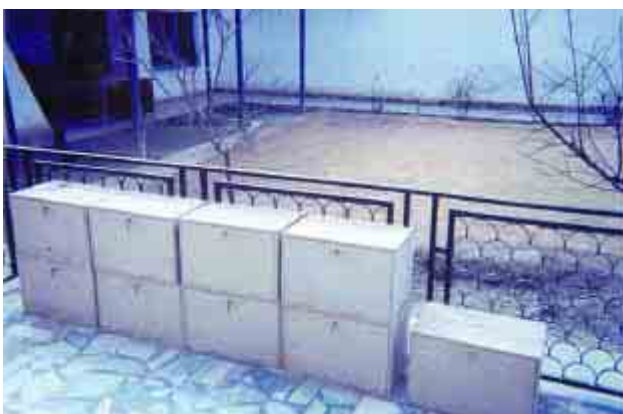
Ballot boxes at Loya Jirga Commission Headquarters

Each identity document possesses a unique 7- to 8-digit number. It is a photographic ID, and woman are permitted (and were permitted under the Taliban) to be photographed for ID purposes. Anecdotally, it is reported that ID document possession is high in cities and low in rural areas, where the education, health, job, or public service uses are not prevalent. The last reported ID issuance campaign was in 1974. A leading expert on women’s rights in