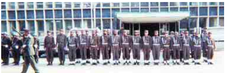
Police drills at Ministry of Interior Headquarters

Afghanistan requires two years of service, either in the army or police.