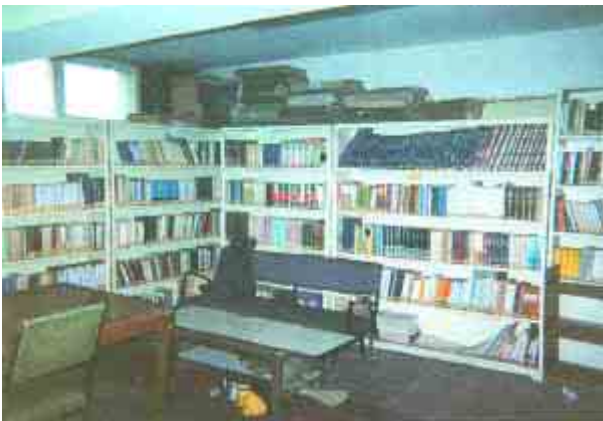
The Supreme Court Law Library

Needs and current international assistance. In response to a question about requests to the international community, the Chief Justice of the Supreme Court stated, “We have two requests: one is for materials, the second is for help guiding us according to our law and order” (as opposed to foreign legal systems). In conclusion, the Chief Justice noted, “We are in a bad condition. We don't have anything in terms of materials. We have our Constitution and act according to the holy Koran.”