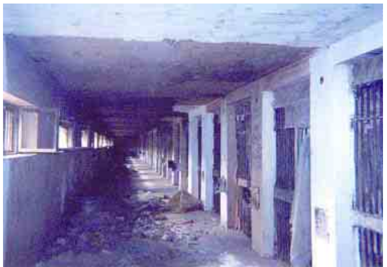
Solitary confinement cells at Pulecharkhi prison

The starting point for designing assistance in support of the rule of law in Afghanistan is the framework laid out in the Bonn Agreement. Under Bonn, work on a new constitution—which will establish the framework for the country's permanent governmental and legal system—will not begin until after the convening of an Emergency Loya Jirga in June 2002. Given this timeframe, Bonn provides for an interim legal system, to govern pending the adoption of a new constitution.