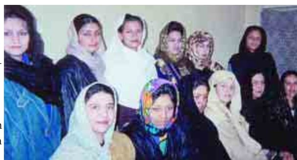
Female professional and administrative staff at the Kabul Provincial Prosecutor offices

The Bonn Agreement. Under the Bonn Agreement, the "Interim Authority and the Emergency Loya Jirga shall act in accordance with the basic principles and provisions contained in international instruments on human rights and international humanitarian law to which Afghanistan is a party." The Bonn Agreement also provides that the IA shall, with the assistance of the United Nations, establish an independent Human Rights Commission, whose responsibilities will include