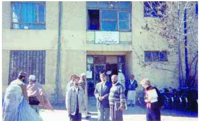
Offices of Kabul Provincial Prosecutor