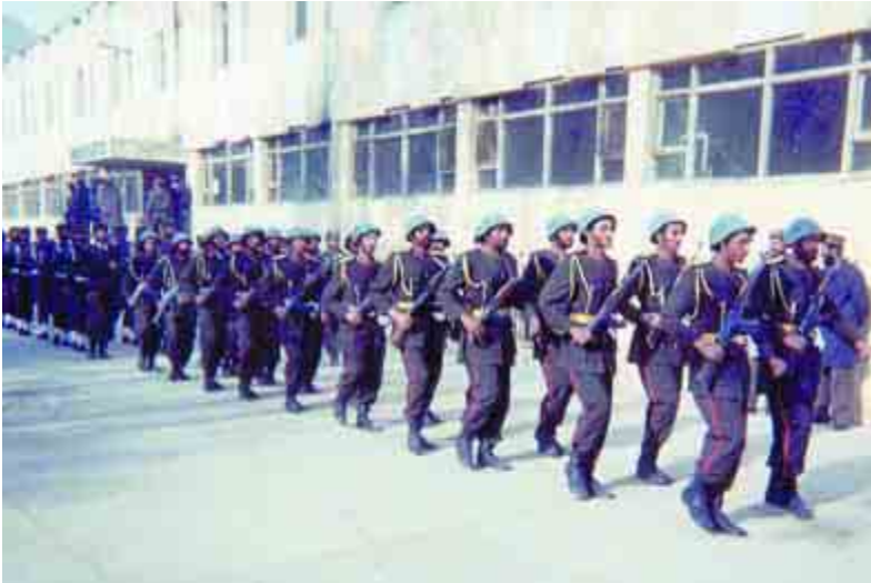
Police marching at Ministry of Interior Headquarters

UN, there are only small groups remaining outside designated army quarters. Both army and police are armed, but neither has been paid since August 2001, except for a one-month payment in January. In the meantime, “on the spot” assessment of fines is an alternate source of revenue for police. Conscripts are fed at the barracks.