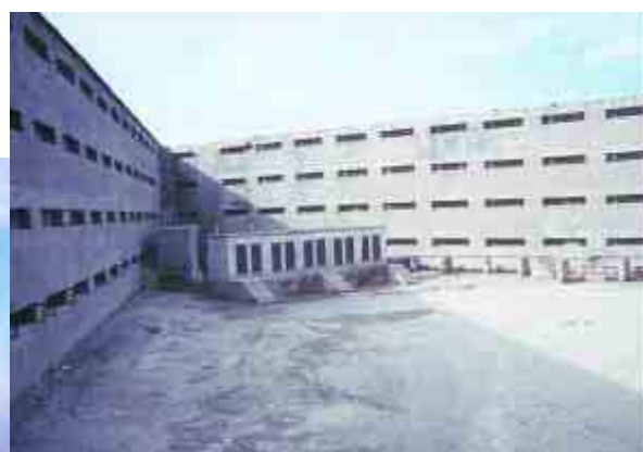
Assembly yard at Pulecharkhi Prison