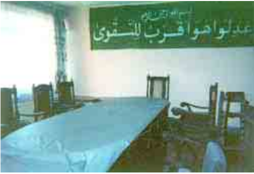
Chambers of the Supreme Court